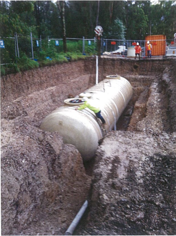
Installation of HV cabling, pits and tanks.