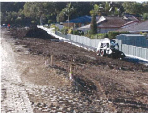
The soundwall batter being spread with topsoil.

Infrastructure and Bulk Earthworks including the construction of sound wall.