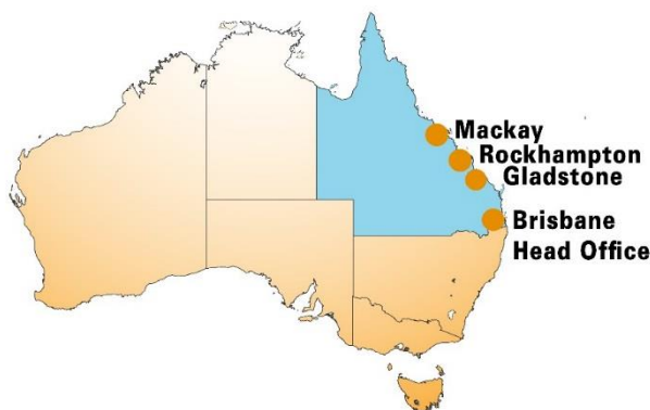
Figure 1: Safe Dig Service Depot Locations